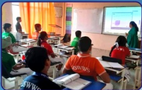
Smart Class Room